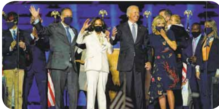
President-elect Joe Biden and Vice President-elect Kamala Harris celebrate their victory with their families in Wilmington, Delaware on Nov. 7, 2020.,

The program will feature New York natives Lady Gaga, who will sing the national anthem, and Jennifer Lopez, who will provide a musical performance. Speakers will